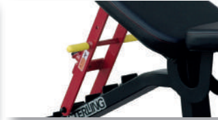
Adjustable Back Support