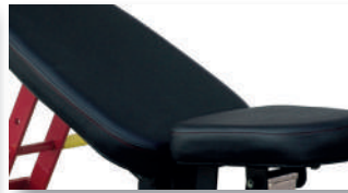
Black Comfortable Pad