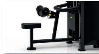
Black Moulded PU Foam