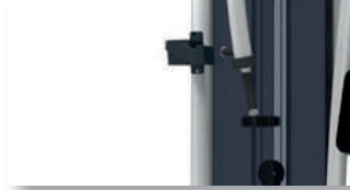
Water Bottle Holder

The Perform Series Pec Fly / Rear Delt machine features two independent pivoting arms with dual position handgrips and a starting position that is adjustable over a 90-degree range. The traditional seating position is perfect for isolating the pectorals, then spin round and hit the delts. The Pec Fly/ Rear Delt machine allows for independent movement of each arm, encouraging symmetrical strength development and allowing for unilateral, bilateral, alternating, or high-speed reciprocal training.