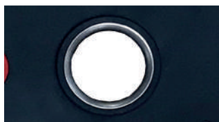
Stainless Steel Inner Ring