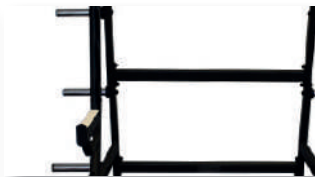
Plate Storage Horns