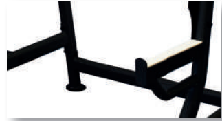
Safety Bar Support

Sturdy and stable, the Pro Series Squat Rack is the perfect solution for any home gym or light commercial fitness facility. The walk through design integrated with adjustable bar supports and gun style racking makes an extremely versatile and safe workout station.