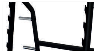
9 Height Options