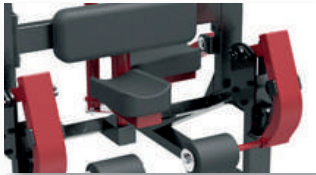
Black Comfortable Pad