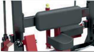
Adjustable Knee Height