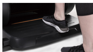
Easy to Step Onto