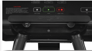
Charging / Storage